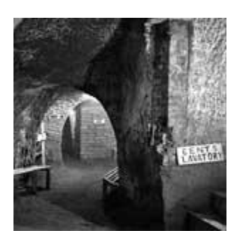
For Opening times and bookings please contact the venue direct –

http://www.airraidshelters.org.uk/educ_visits.asp